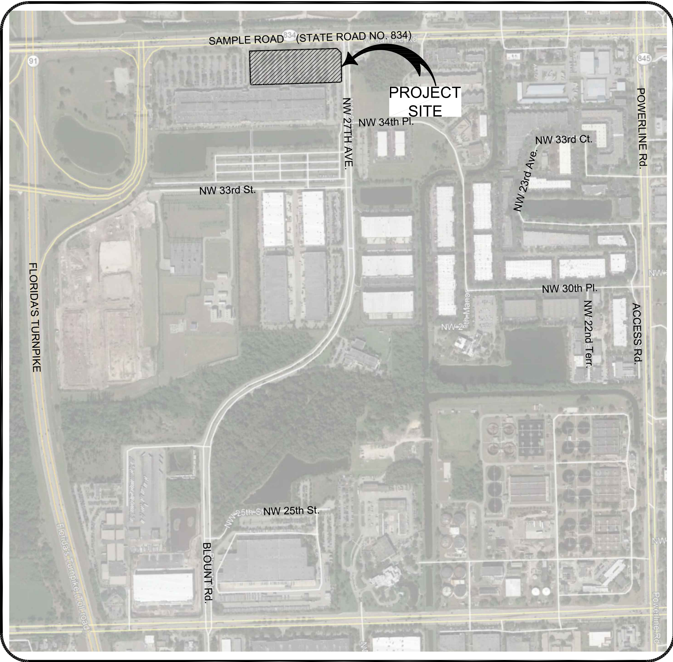
BROWARD COUNTY, FLORIDA SECTION 21, TOWNSHIP 48 SOUTH, RANGE 42 EAST VICINITY MAP SCALE: N.T.S.

SOUTH FLORIDA WATER MANAGEMENT DISTRICT 3301 GUN CLUB ROAD WEST PALM BEACH, FLORIDA 33406 (561) 682-6979